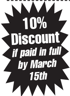
EXHIBIT SPACE RESERVATION FORM

Reserve space now by returning the attached form.